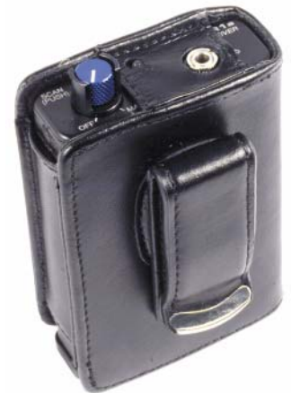
The R1a comes with a protective leather pouch with an integrated belt clip.

The receiver is housed in a compact machined aluminum enclosure. The unit features an integral rotating battery door that remains attached to the housing when opened. All nomenclature is laser engraved into the housing to withstand physical abrasion and heavy use. A condensed instruction set is also laser etched into the side panel of the receiver.