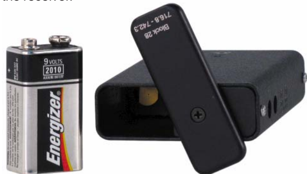
An attached rotating door makes battery installation easy.